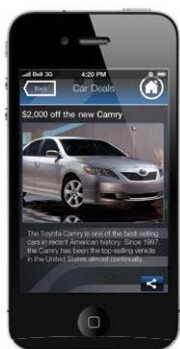
Launch your branded mobile app