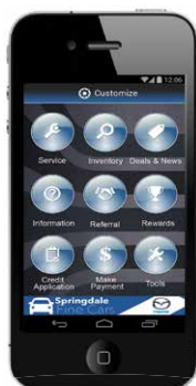
Customer downloads app